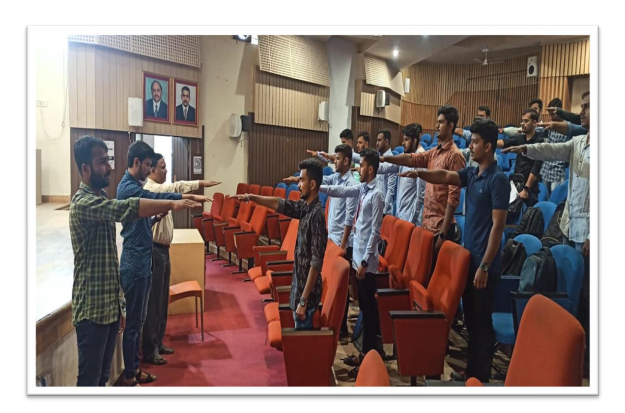
NSS Volunteers taking Oath on occasion of Constitution Day